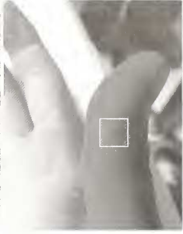
was monitored in hospital after one hour of envenomation. White rectangle shows the area where the aculeus penetrated the skin.

Below are the observations made by the patient himself and two eyewitnesses. After arrival of the ambulance at 9:55 p.m., the medical team decided to monitor the patient and not immediately administer antivenom. However, one litre of sodium chloride was intravenously applied as an infusion and antihistamine was administered. Additionally, in order to reduce the pain, an initial mild painkiller was dispensed in the envenomation area. A full blood count, liver function, electrolyte blood levels and other routine laboratory tests were conducted and all showed normal values after 25 minutes of envenomation.